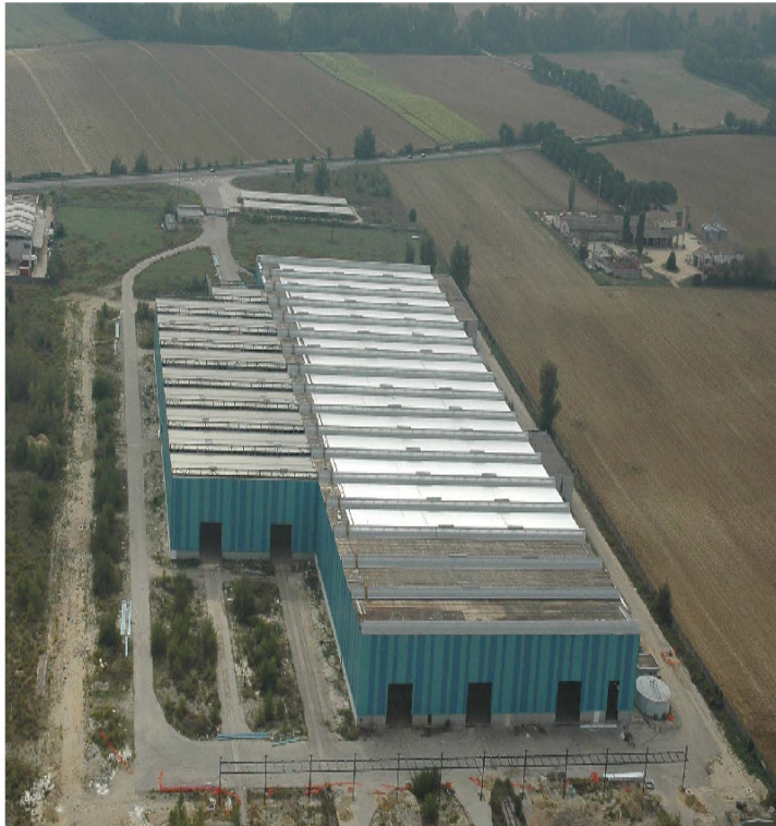
Corpo principale (mq 29.835) Veduta aerea (in costruzione), lato Nord